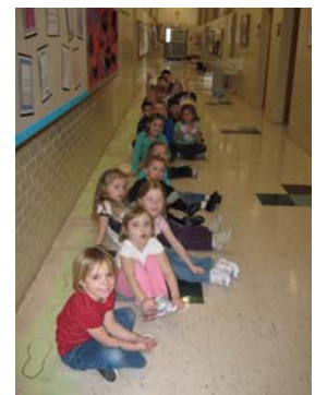
100 steps with Christ on the 100th day of school